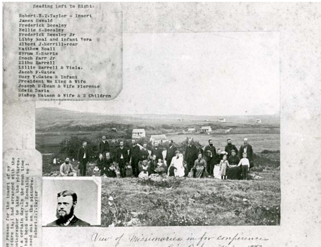
Figure 3: A Picture of Missionaries at Conference Time, Lā`ie, 1887