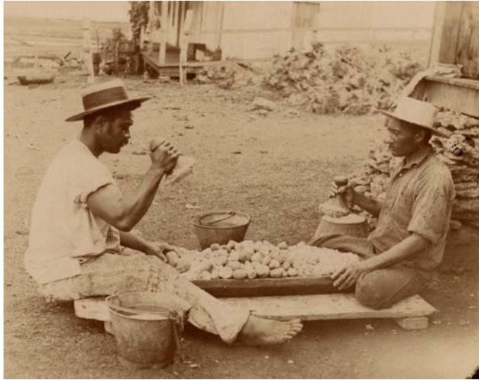
Figure 1: Two Men Making Poi from Kalo on La`ie Plantation in Early 1899

Otto Ford Hassing, Honolulu and Laie Plantation Hawaiian Mission, January-February, 1899 , Ph. 5841, Historical Department of The Church of Jesus Christ of Latter-day Saints, Salt Lake City.