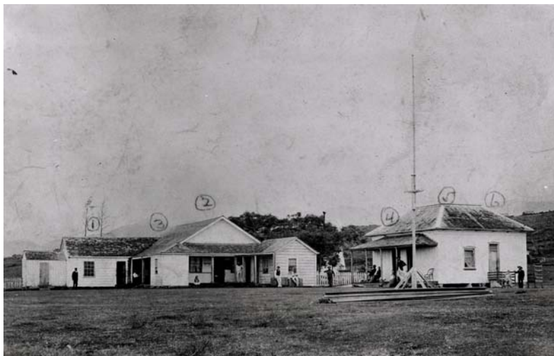
Figure 2: Missionary Compound, 1888

The four bedroom apartment built by Matthew Noall is on the right. The center building is the main missionary building housing some of the missionaries, the kitchen meeting areas, etc. The building added on to the far left is the store.